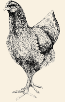
Ross & Cobb Chicken